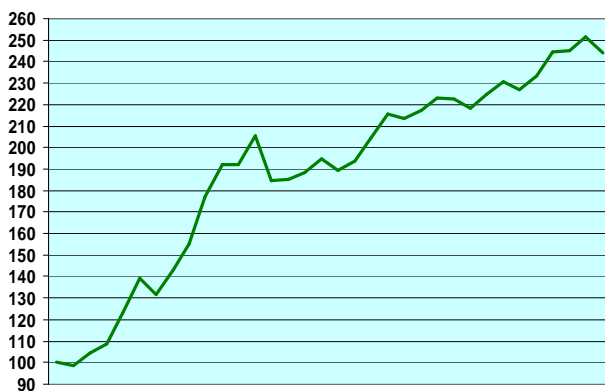
FUND MONTHLY GROWTH (Apr 05-Jan 08)